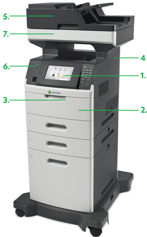
XM5163 model with 550-sheet tray, 2100 sheet tray and caster base