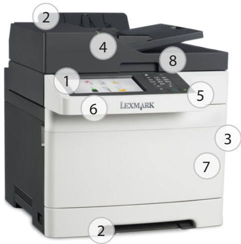
XC2132 with 7-inch color touch screen